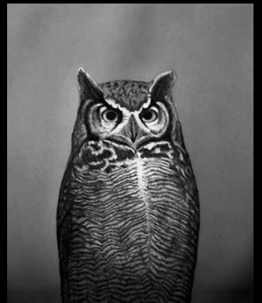
Beth Van Hoesen, Buster , 1982, Spit-bite aquatint, drypoint & etching, 20 x 17 3/4