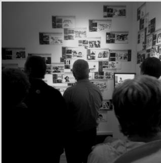
L.L.I. Group tour through On Watching and Being Seen